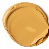
601 NAPLES YELLOW HUE PBr24 • PW6 S2 ■ ☀