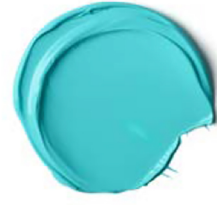
770 LIGHT BLUE PERMANENT PB15:3 • PG7 • PW6 S1 ■ ☀