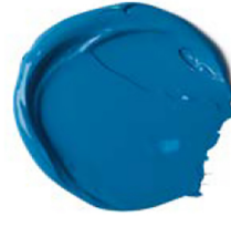
470 CERULEAN BLUE HUE PB29 • PG7 • PW6 • PB15:3 S2 ■ ☀