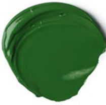
166 CHROMIUM OXIDE GREEN PG17 S2 ■ ☀