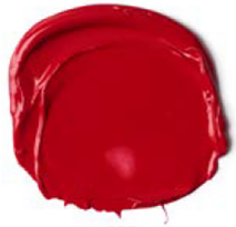
292 NAPHTHOL CRIMSON PR170 S2 ◐ ☀