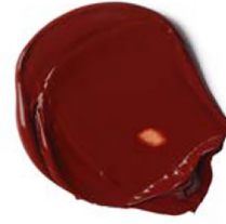
127 BURNT SIENNA PR101 • PBk11 S1 ■ ☀