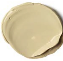
434 UNBLEACHED TITANIUM PW6 • PY42 • PR101 • PBk11 S1 ■ ☀