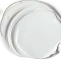
430 TRANSPARENT MIXING WHITE PW6 S1 □ ☀