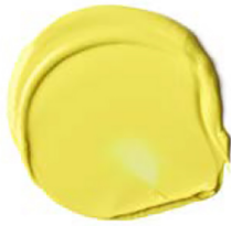
411 YELLOW LIGHT HANSA PY3 S1 □ ☀