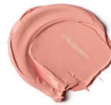
810 LIGHT PINK PR188 • P036 • PW6 S1 ■ ☀