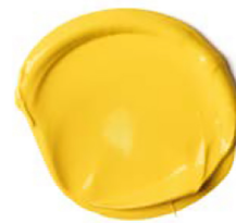
890 CADMIUM-FREE YELLOW MEDIUM S3 ■ ☀