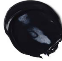
310 PAYNE'S GRAY PB29 • PBk11 • PV15 S1 ■ ☀