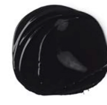
276 MARS BLACK PBk11 S1 ■ ☀