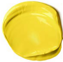
889 CADMIUM-FREE YELLOWLIGHT S3 ■ ☀