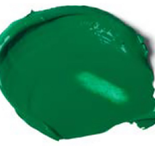
450 EMERALD GREEN PG7 • PY97 • PW6 S2 ■ ☀