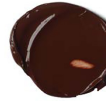
128 BURNT UMBER PBr7 S1 ■ ☀