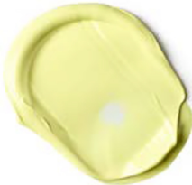
156 LIGHT BISMUTH YELLOW PY184 • PW6 S1 ◐ ☀

☀ Excellent ☀ Very good ☀ Not ASTM rated