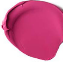
500 MEDIUM MAGENTA PR122 • PW6 S1 ■ ☀