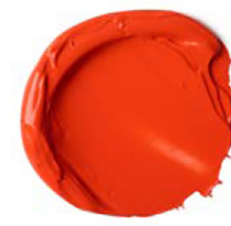
323 PYRROLE ORANGE P073 S4 ◐ ☀