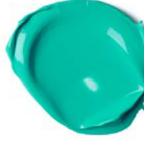
660 BRIGHT AQUA GREEN PG7 • PB15:3 • PW6 S1 ■ ☀