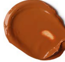
330 RAW SIENNA PR101 • PBk11 • PY42 S1 ■ ☀