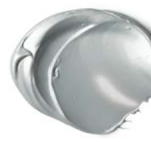
236 IRIDESCENT BRIGHT SILVER S2 ◐ ☀