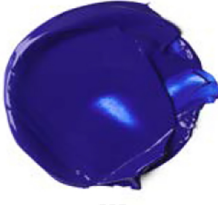
382 ULTRAMARINE BLUE red shade PB29 S1 □ ☀