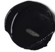
336 LAMP BLACK PBk7 S1 ■ ☀