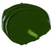
224 HOOKER'S GREEN HUE PERMANENT PG7 • PY110 S1 ◐ ☀