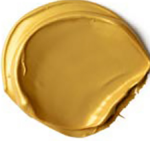
234 IRIDESCENT BRIGHT GOLD S2 ◐ ☀