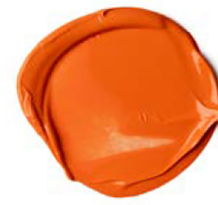
892 CADMIUM-FREE ORANGE S4 ■ ☀