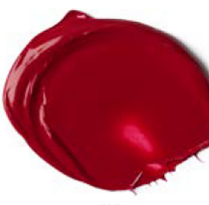
110 QUINACRIDONE CRIMSON PV19 S3 □ ☀