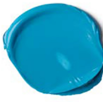
570 BRILLIANT BLUE PB15:3 • PG7 • PW6 S1 ■ ☀