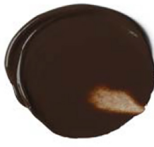
331 RAW UMBER PBr7 S1 ■ ☀