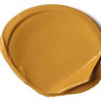
416 YELLOW OXIDE PY42 S1 ■ ☀