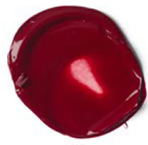
116 ALIZARIN CRIMSON HUE PERMANENT PR179 • PR202 S2 □ ☀