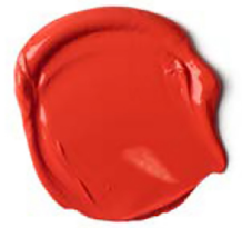
893 CADMIUM-FREE REDLIGHT S5 ■ ☀