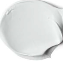
432 TITANIUM WHITE PW6 S1 ■ ☀