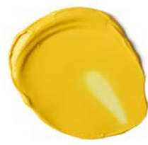
412 YELLOW MEDIUM AZO PY74 S2 ◐ ☀