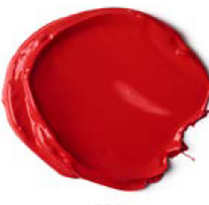
894 CADMIUM-FREE RED MEDIUM S5 ■ ☀