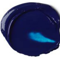
316 PHTHALOCYANINE BLUE green shade PB15:3 S1 □ ☀