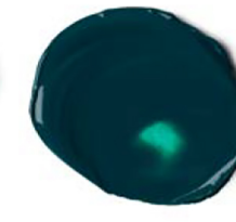
317 PHTHALOCYANINE GREEN blue shade PG7 S1 □ ☀